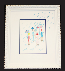
#301 Gold People in the Rain Tina Cunningham